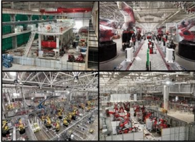
Gigafactory Shanghai making progress

During the quarter, a majority of orders continued to be for a long-range battery option and the Model 3 average selling price (ASP) was stable at approximately $50,000. At the same time, manufacturing costs continued to decline.